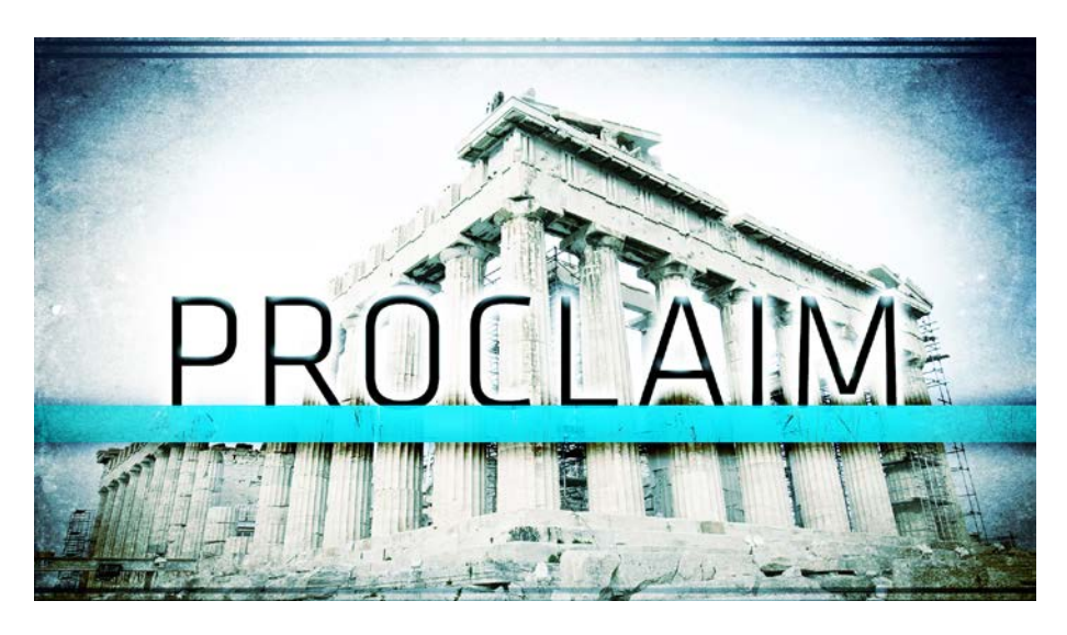
Pastor's LifeGroup • Study of ACTS Persecution Enters the Picture Lesson 4 • Acts 4:5-31